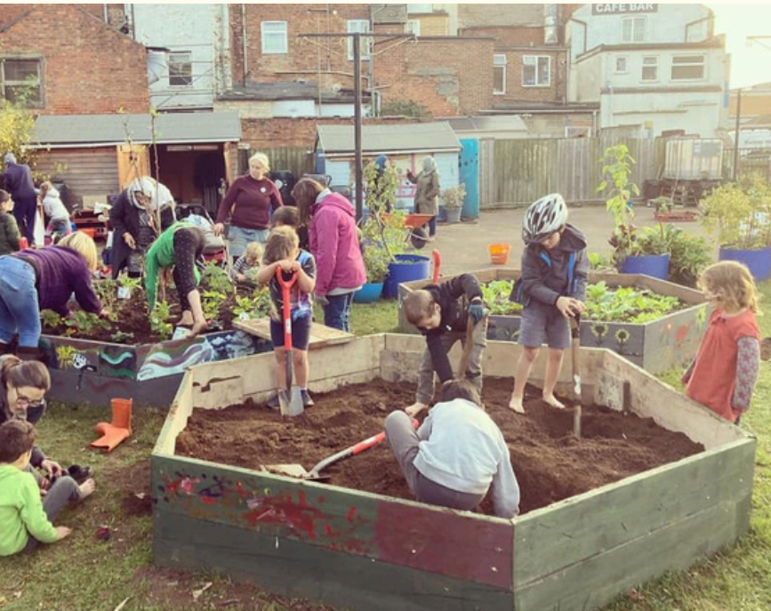
Picture: Bridge Street Community Garden, Banbury